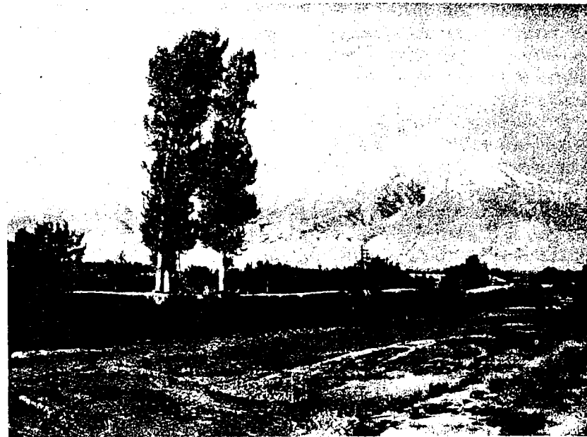
Mount Ararat in Armenia

"The main Armenian plateau lies at an average height of between 4,500 and 5,500 feet above sea level," writes David Marshall Lang. "Almost everywhere, Armenia is higher than the countries which immediately surround it. Cut off from them on virtually all sides by barriers of lofty hills and mountain peaks, Armenia seems like some massive rock-bound island rising out of the surrounding lowlands, steppes and plains." The Armenian people are descended from a sturdy mountain people who regarded their mountain peaks, comely hills, sparkling brooks and streams, and lakes and rivers as religious symbols of God's greatness and mystery. The physical environment of Armenia is a rugged wilderness, often totally hostile to human life. For thousands of years Armenians have used their skills to make this land inhabitable. The Armenian people have had to literally wrest their food from the stones of the Armenian mountains. The climate is varied and harsh, with the intensely freezing winds and snows of winter and the sometimes extreme dry heat of summer. Some areas have winter seven months of the year, whereas other areas, which have wooded mountains and hills, enjoy more moderate temperatures.